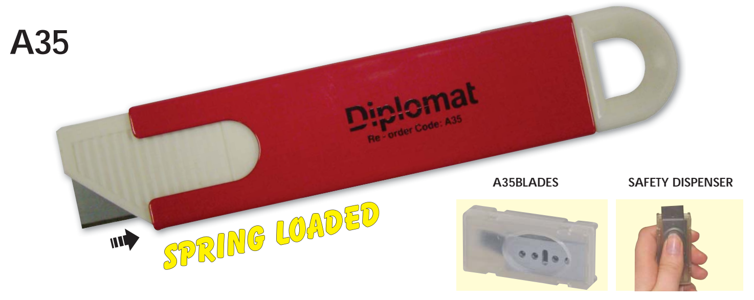
Push to release blade